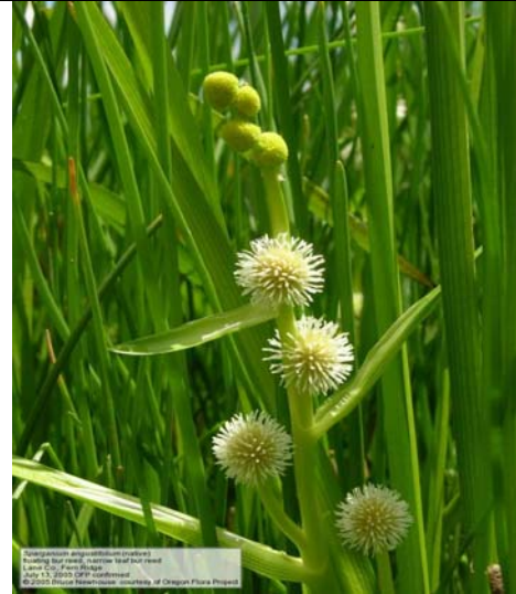
Sparganium angustifolium (native) Floating bur reed, narrow leaf bur reed Lake U.S. near Okech Aug. 12, 2008 (D.F. confirmed)

Common Name(s): Narrow-leaf bur reed Scientific Name(s): Sparganium angustifolium Growth Form: Submersed, floating, sometimes emergent Depth: Up to 3 to 9 ft. Sun Exposure: Full sun to part shade Reproduction: Seed Propagation: Seed; divided plants Planting Zone: Wet Planting Guidance: Plant whole plants or seedlings directly in place during the summer