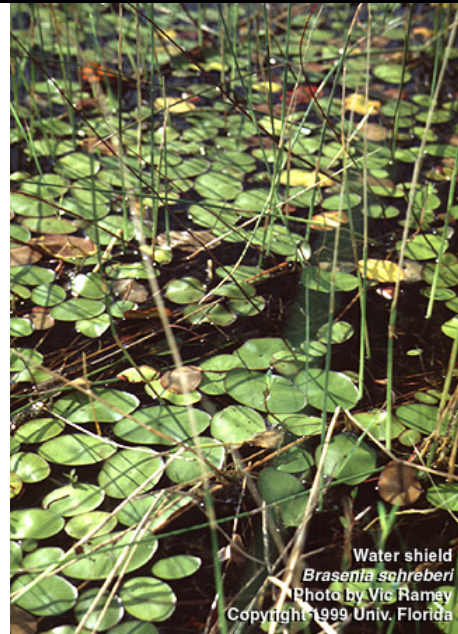
Water shield Brasenia schreberi