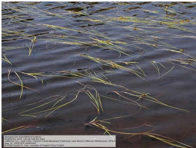
Sparganium angustifolium (native) Floating bur reed, narrow leaf bur reed Jefferson Co., Jack Lake, Canyon Creek Meadows Trailhead, near Mount Jefferson Wilderness, 1870m Aug. 12, 2008 (D.F. confirmed)

Comments: A closely related species, broad-fruit bur reed ( Sparganium eurycarpum ) is also native; however, it is known to be problematic in some western waters. Other closely related, but non-native species are widely available but should NOT be planted (e.g., European bur reed, S. emersum )