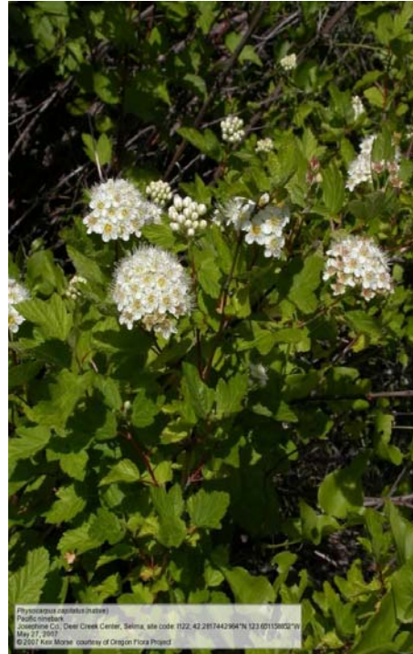
Physocarpus capitatus (maxim) Pacific ninebark Josephine Co., Deer Creek Center, Belton, site code 1222, 43 281744296W 123 02154023N May 27, 2007

Common Name(s): Pacific ninebark Scientific Name(s) Physocarpus capitatus Growth Form: Tree/shrub Height: Up to 13 ft./10 -15 ft. spread Sun Exposure: Sun to shade Reproduction: Seed Propagation: 1 gal. pots, saplings Planting Zone: Moist to wet Planting Guidance: Plant 6-8 feet on center from October to April when ground is moist Comments: White flowers clusters in early summer; capable of withstanding a wide range of conditions; unusual scaly bark. Typically grows 10-15 feet in height with equivalent spread. Known to attract hummingbirds and butterflies