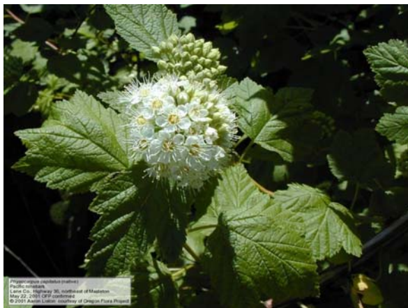
Physocarpus capitatus (maxim) Pacific ninebark Lane Co., Highway 36, northeast of Madras May 25, 2007, CRP collection