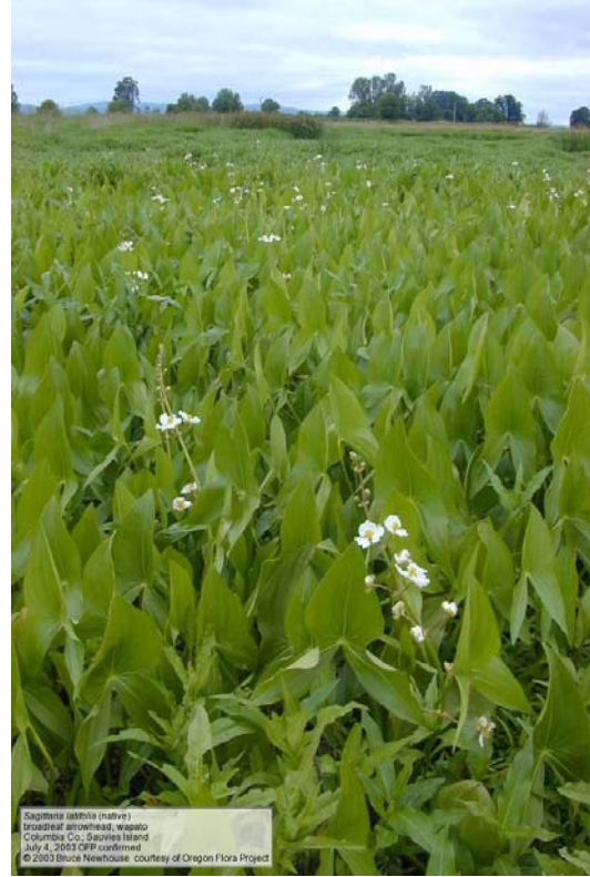
Sagittaria latifolia (native) broadleaf arrowhead, wapato Columbia Co., Seaside Island July 4, 2003 CFP confirmed

Common Name(s): Wapato Arrowhead Scientific Name(s): Sagittaria latifolia Height: Up to 2 ft. tall Sun Exposure: Part shade to sun Reproduction: Stolons, rhizomes, tubers Propagation: Potted whole plants Planting Zone: Wet Planting Guidance: Whole plants in fabric pots; tubers sown directly into sediment; commercially available as whole plants but will spread by seed and runners Comments: Emergent leaves; white flowers; fast-growing; prefers gentle slopes; ducks favor the shoots, tubers, and seeds; attracts butterflies