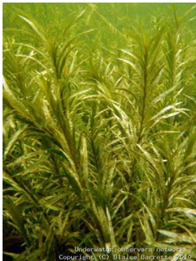
Underwater observers network

Planting Guidance: Very little information is available on planting guidance for plant; however, some nurseries may have the capability of rearing starts for restoration projects Comments: A robust, usually low growing submersed plant that only tops out during flowering (late summer); slow growth rate with moderate vegetative spread; stems can grow to 5 ft.; although typically around 2 ft. tall