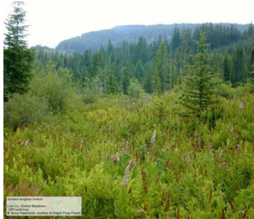
Spiraea douglasii (Douglas Spirea) East Co. Oregon Wetlands 2/19/2016

Common Name(s): Douglas spirea Scientific Name(s): Spiraea douglasii Growth Form: Tree/shrub Height: 3 to 11 ft. Sun Exposure: Full sun to part shade Reproduction: Seed, rhizome Propagation: 1 or 2 gal. pots Planting Zone: Moist to wet Planting Guidance: Plant 6-8 feet on center during fall/winter/spring when ground is moist Comments: Rapidly spreading and can crowd out other plantings; only plant in areas where quick cover and limited diversity is desired