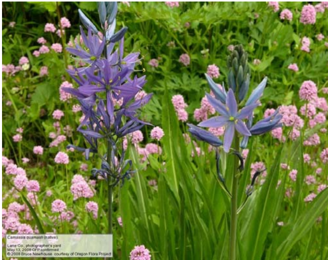
Camassia quamash (native) Lane Co., photographer's yard May 13, 2008. QFP confirmed