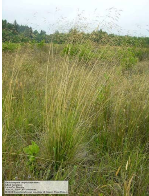
Deschampsia cespitosa (Native) tufted hairgrass Lane Co., Murphy July 22, 2008 CFP confirmed

Common Name(s): Tufted hairgrass Tussock grass Scientific Name(s): Deschampsia cespitosa Height: Variable, up to 5 ft. tall with approximately 12 in. spread Sun Exposure: Partial shade Reproduction: Seed Propagation: Tuber, cuttings/stakes; seeding Planting Zone: Shoreline; dry to moist Planting Guidance: 2 to 3 lbs. seed/acre in spring or fall (cut to ½ lb. in areas where greater plant diversity is sought; divided whole plants in late spring; Comments: Attractive in groups for meadow effect; tuft-forming; occurs in both fresh- and salt-water areas; intolerant of year-round flooding; known to attract butterflies