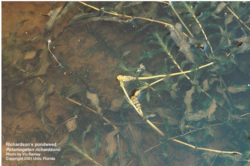
Richardson's pondweed Potamogeton richardsonii