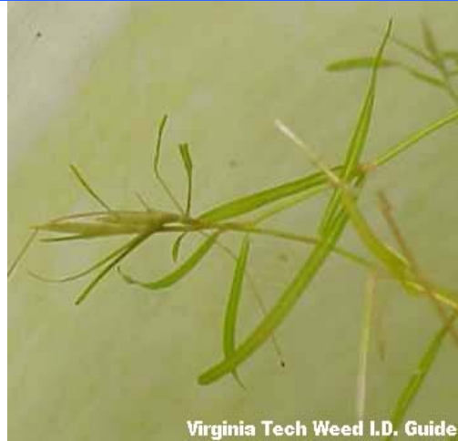
Virginia Tech Weed I.D. Guide

Common Name(s): Small pondweed Lesser pondweed Scientific Name(s): Potamogeton pusillus Maximum Depth: Approximately 15 ft. Top Out Depth: Approximately 4 to 6 ft. Reproduction: Seeds; winter buds Propagation: Commercial sources of propagules is limited Planting Zone: Submersed Planting Guidance: See Propagation; if still present in Devils Lake then likely to spread from existing populations Comments: Previously known to occur in Devils Lake; tolerates brackish conditions; submersed stems may grow to water surface; seeds provide food for wildlife