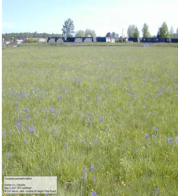
Camassia quamash (native) Benton Co., Corvallis May 5, 2011. QFP confirmed

Common Name(s): Camas Scientific Name(s): Camassia quamash Growth Form: Shoreline Height: Up to 1 ft. Sun Exposure: Sun to part shade Reproduction: Tuber, seed Propagation: 1 gal. container Planting Zone: Dry to moist Planting Guidance: Plant tubers in fall Comments: Occurs primarily in seasonally wet swales (springtime). Spikes of bluish-purple flower clusters. Important plant for Native American use