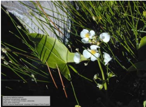
Sagittaria latifolia (native) broadleaf arrowhead, wapato Columbia Co., Seaside Island July 4, 2003 CFP confirmed