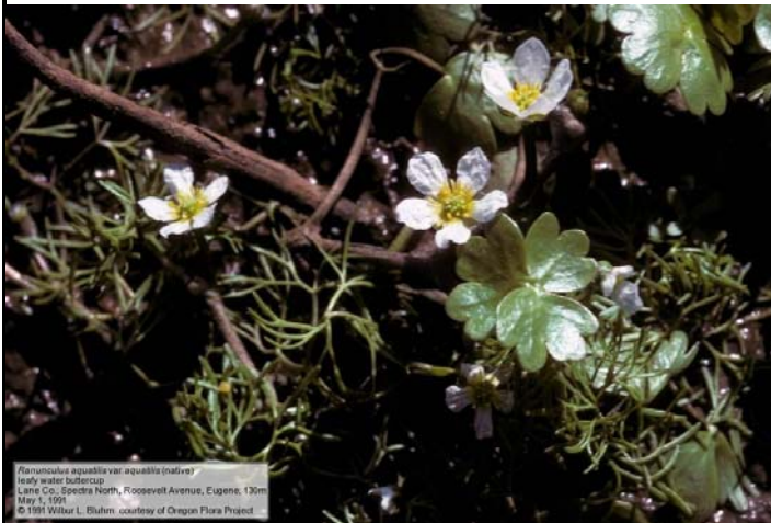
Ranunculus aquatilis var. aquatilis (native) leafy water buttercup Lane Co., Spectra North, Roosevelt Avenue, Eugene, 130m May 1, 1991