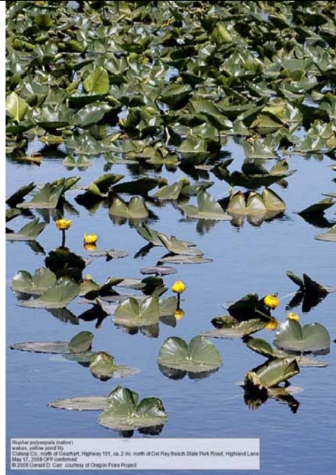
Nuphar polysepala (native) Western yellow pond lily Clatsop Co., north of Gearhart, Highway 101, ca. 2 mi. north of Del Rey Beach State Park Road, Highland Lane May 12, 2008 GFP confirmed

Common Name(s): Western yellow pond lily Spatterdock Scientific Name(s): Nuphar polysepala Nymphaea polysepala Nuphar polysepalum Nuphar lutea ssp. polysepala Nuphar lutea Maximum Depth: Approx. 4 ft. Sun Exposure: Shade intolerant Reproduction: Rhizome, seed Propagation: Rhizomes Planting Zone: Submersed near shoreline Planting Guidance: Rhizomes directly into the lake bottom Comments: Currently present in Devils Lake; rapid vegetative growth rate; may become weedy; however, this pond lily is an alternative to fragrant water lily ( Nymphaea odorata ) which is highly invasive and should NOT be planted