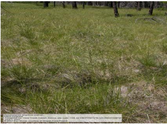
Deschampsia cespitosa (Native) tufted hairgrass Lane Co., Murphy July 22, 2008 CFP confirmed