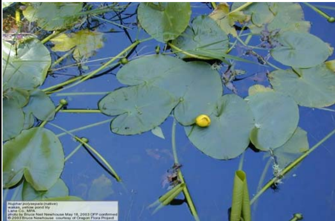
Nuphar polysepala (native) Western yellow pond lily Lake Co., MFA May 18, 2003 GFP confirmed