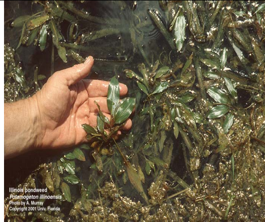
Illinois pondweed Potamogeton illinoensis

Common Name(s): Illinois pondweed Scientific Name(s): Potamogeton illinoensis Maximum Depth: Approximately 15 ft. Top Out Depth: Approximately 8 ft. Reproduction: Rhizomes, seeds, tubers Propagation: Tubers Planting Zone: Shallow shorelines