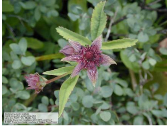
Comarum palustre (purple) marsh cinquefoil, purple marshlocks Linné (1753) - North Park, Middle Fork photo by Bruce Nestor/USFWS 2013. CNF Landmark © 2013 Bruce Nestor/USFWS (courtesy of Oregon Trust Project)