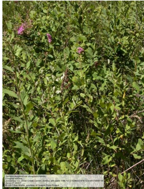
Spiraea douglasii var. douglasii (Douglas Spirea) Douglas Spirea Josephine Co., Clear Creek Center, Smith, site code 1185, 42° 27' 6.38" N, 123° 41' 50.81" W June 27, 2017